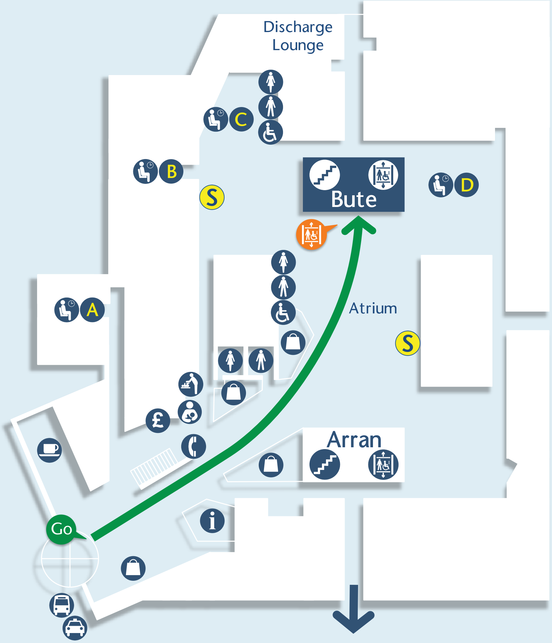
This Level 0