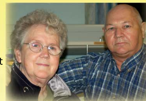
'This service has been a lifeline to us'

Visiting loved ones in hospital is not always easy, particularly for older people, people living with a disability or those on a low income. The hospital evening visitor transport service makes it easier. Here we explain how it works and how you can access the hospital evening visitor transport service.